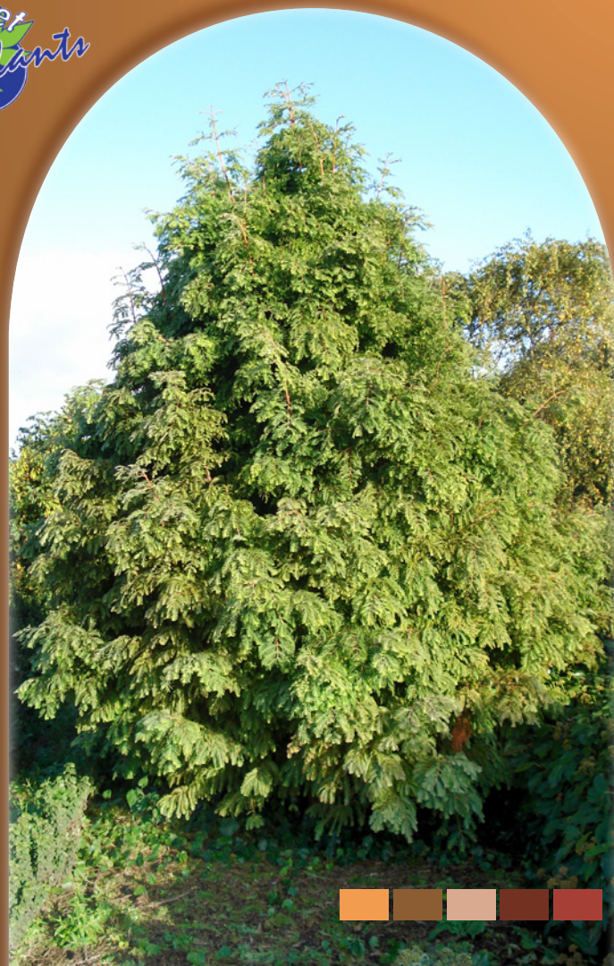
Metasequoia glyptostroboides 'Chubby'

I t sounds incredible for a Metasequoia , yet 'Chubby' is a variety that stays small. After 10 years this slow-growing conifer reaches a height of about 10 ft (3 m). It branches with large sturdy branches, forming a beautiful pyramid. The thick year-old branches contribute to the chubby effect of the tree. The adult foliage of Metasequoia glyptostroboides 'Chubby' is bright green while the young shoots have a striking blue glow. "Chubby" is fully hardy.