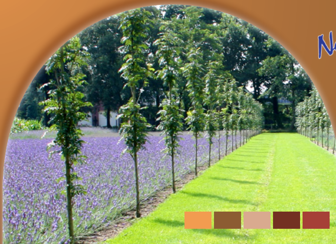
Sorbus aucuparia 'Flanrock' PBR AUTUMN SPIRE®

S orbus aucuparia Autumn Spire has a fastigate growth habit, even at early age. The pinnate leaves are dark green and have a deep purple color in the fall. Autumn Spire flowers in spring with white flowers in flat screens, followed by yellow-orange berries in autumn. Autumn Spire is very hardy and an absolutely fantastic street tree.