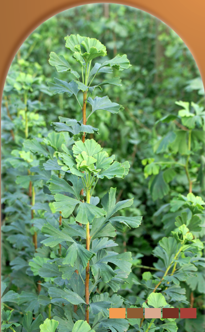
Ginkgo biloba 'Menhir'

G inkgo biloba 'Menhir' is what the name suggests, a slender upright columnar tree which forms a nice straight tree without having to tie it up. Already in a young stage 'Menhir' has a steady and strong growth. The foliage of 'Menhir' is nicely carved and has a gray-blue color. In autumn the Ginkgo colors yellow and keeps that color for a long time. 'Menhir' is resistant to disease and grows in any soil type.