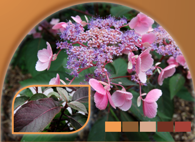
Hydrangea aspera 'Hot Chocolat'

H Hydrangea aspera 'Hot Chocolat' has large lacecaps. Around the edge attractive pink flowers and in the heart blue fertile flowers at the end of sturdy brown red twigs. The underside of the leaf is striking burgundy. The top is chocolate brown, fading to deep green later in the season. 'Hot Chocolat' is a hardy shrub.