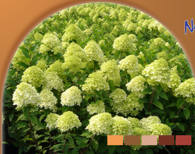
Hydrangea paniculata 'Limelight'

Hydrangea paniculata 'Limelight' flowers from the second half of the summer into autumn with elegant creamy white to lime-colored flowers. The bushy flowers have sturdy branches that do not tip over, even after a heavy rain shower. 'Limelight' flourishes on new wood and is a fully hardy and carefree plant. Firm annually pruning reinforces blooming.