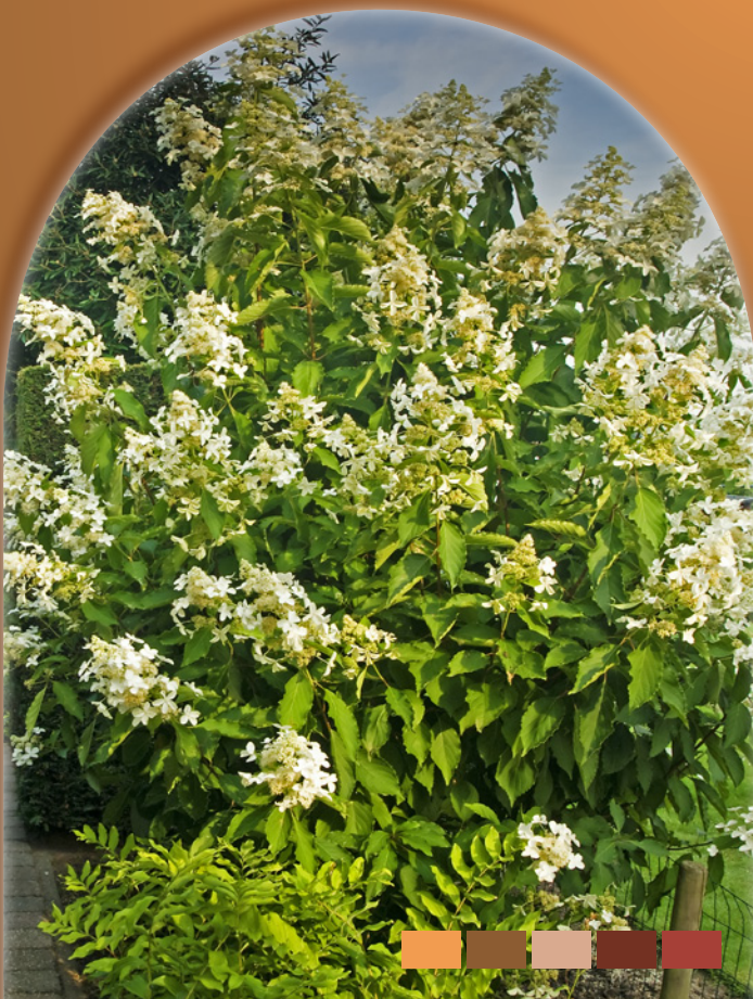
Hydrangea paniculata 'Levana'

The main feature of Hydrangea paniculata 'Levana' are the enormous, up to 20" (50 cm) long, panicles. The pure white flowers measuring about 2" (5 cm) across, grow at the end of up to 7 ft (2 m) long, remarkably sturdy twigs. The flowers of 'Levana' consist of four or five well separated sepals that appear like stars around the flower panicles in July and August. The giant mass of fragrant white flowers attracts many insects. 'Levana' is a very healthy plant, not suffering from diseases. It likes a sunny spot and can be planted as a solitary plant but can just as well be planted in larger groups. The flowers of 'Levana' are also ideal cut flowers.