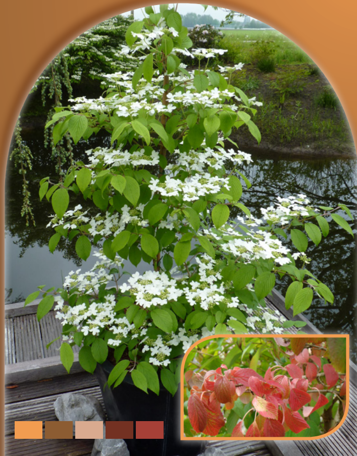
Viburnum plicatum 'jww-1' PBR KILIMANDJARO®

V viburnum plicatum Kilimandjaro grows like a pyramid that looks like the snow covered Kilimandjaro when it flowers with its white lacecap flowers. All four seasons long, Kilimandjaro is a special appearance.