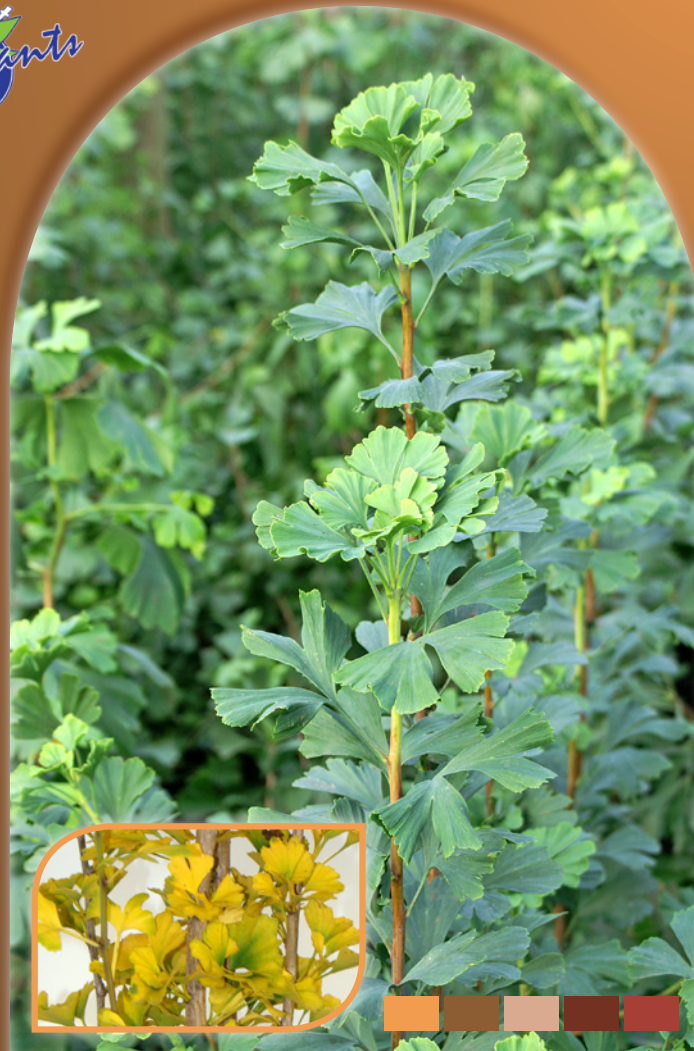
Ginkgo biloba 'Menhir'

S orbus aucuparia Autumn Spire has a fastigiate growth habit, even at early age. The pinnate leaves are dark green and have a deep purple color in the fall. Autumn Spire flowers in spring with white flowers in flat screens, followed by yellow-orange berries in autumn. Autumn Spire is very hardy and an absolutely fantastic street tree.