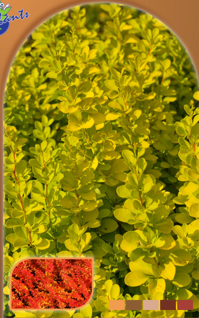
Berberis thunbergii 'Maria'

B erberis thunbergii 'Maria' is a deciduous shrub of about one meter (3 ft). The young shoots are bright red in spring. Then the foliage is deeply yellow, only slightly fading in summer. Even on warm and sunny days, the foliage will not suffer from sun burn. 'Maria' is very mildew resistant. In autumn the foliage colors intensely orange.