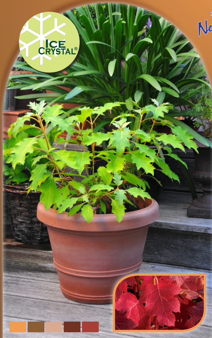
Hydrangea quercifolia 'Ice Crystal'

I ce Crystal has exceptional deeply cut leaves and the remains extremely juvenile and bushy as a result of in vitro propagation. Behind glass 'Ice Crystal' flowers with creamy white flowers starting in May. Outside the flowers appear in June / July. 'Ice Crystal' has beautiful fall colors and is very hardy. It is resistant to drought, grows easily in pot or garden, and is at its best in large groups.